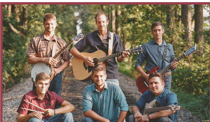
Call of Grace Band

Shady Maple Banquet Center | 129 Toddy Drive • East Earl, PA